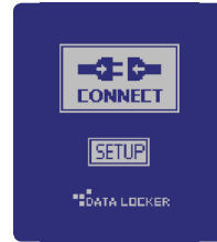
USB 3.0 Interface (USB 2.0 Compatible) No External Power Required