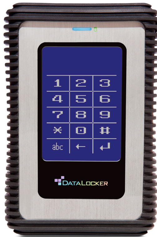
Two-Factor Authentication via RFID Card (available in some models)